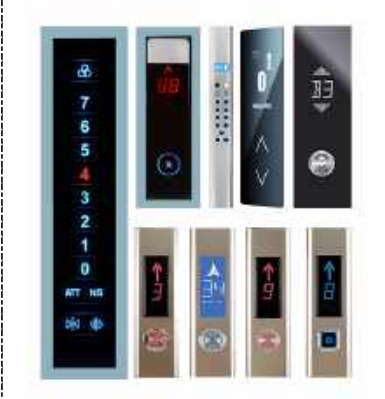
CAR AND LANDING OPERATING PANEL